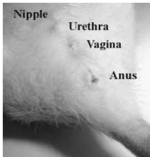
Female - Adult

It is also useful to bear in mind that females can be spayed and male rats can be neutered. Neutering is preferable if you want to keep your rats in mixed sex groups, because this procedure is less invasive than the surgery required for spaying. Always remember to ensure that your chosen veterinary clinic has adequate experience in the procedure and that you follow all pre and post-surgery care set by your veterinarian.