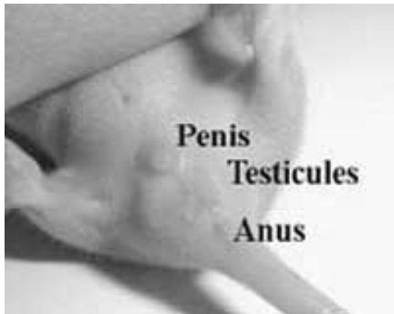
Male - 2 weeks old

Younger rats, as young as a day old can be sexed, females will have small dots where the nipples will be and males will have a small bump where the testicles and penis will be located. It often takes a while for young males to show however so be very careful.